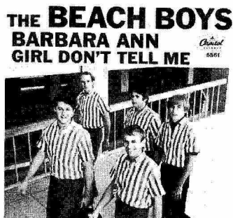
2. The Beach Boys 535