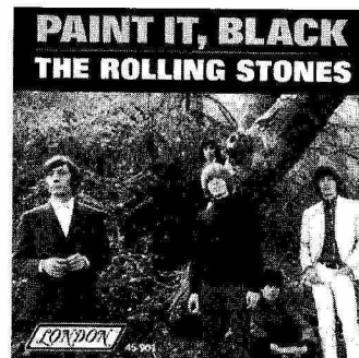
3. The Rolling Stones 487